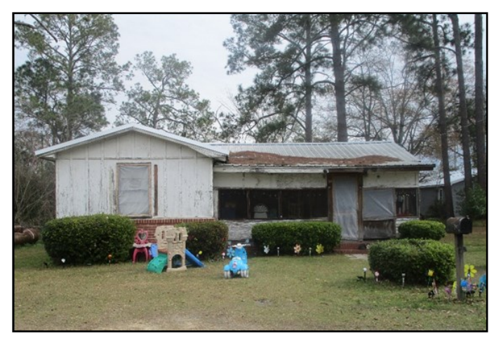
Another home in the Adel Target Area that is in need of rehabilitation.

The Cities of Adel, Fitzgerald, and Tifton each received $400,000 to provide housing rehabilitation of owner-occupied houses. The SGRC Community and Economic Development Division will administer the Adel and Fitzgerald projects.