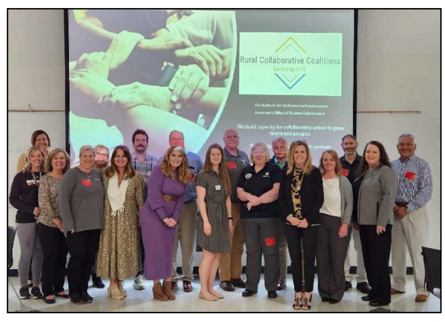
Attendees of the statewide Rural Collaborative Coalition Meeting.

tended the meeting to understand how to build community collaborations focused on training students for high-quality careers. Understanding how to foster partnerships within a workforce sector or for a program launch helps to ensure that the many systemic challenges impacting the workforce and economic development in an area get addressed to support sustainable success for a community.