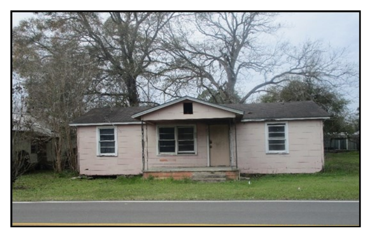
A home in the Adel Target Area that is in need of rehabilitation.

The Cities of Adel, Fitzgerald, and Tifton all have areas of low-moderate income residents that live in substandard and dilapidated housing. Families in these areas will now be given the opportunity to improve their quality of life through housing rehabilitation and renovations that will create a safer and more affordable living environment.