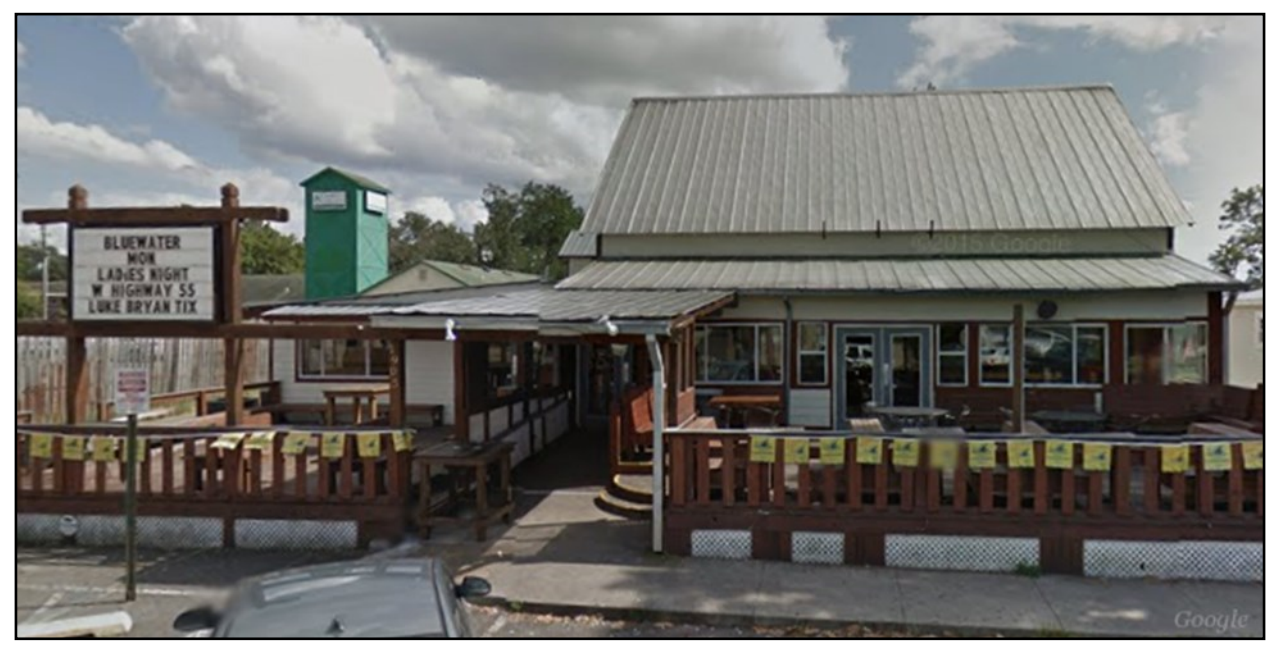
BlueWater Valdosta located in Remerton

BlueWater Valdosta has been a mainstay college bar operating successfully in Remerton for over twenty years. Remerton, once known as Mill Town, is a small municipality entirely landlocked by the City of Valdosta and located just a few miles from Valdosta State University's (VSU) main campus. This area is a popular place for VSU students to live and socialize. It is home to shops, bars, and restaurants where students hang out. BlueWater Valdosta is one of a few businesses with live music performances, DJ-played music for dancing, and all types of beer, wine, and liquor. It is a full-service bar. The current owner, Blain Nobles, took ownership and management in early 2019. Through his leadership, BlueWater weathered the 2020 pandemic very well.