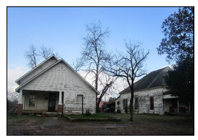
Homes within the Fitzgerald Target Area that are in of rehabilitation.